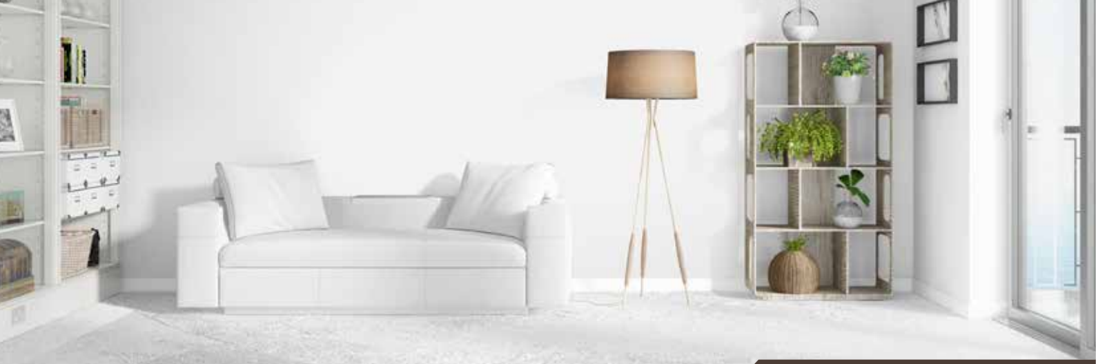
*Stock photograph only for indicative purpose. Actual product may differ. The furniture, fittings and fixtures shown in the image are merely indicative in nature and may not be provided with final product.